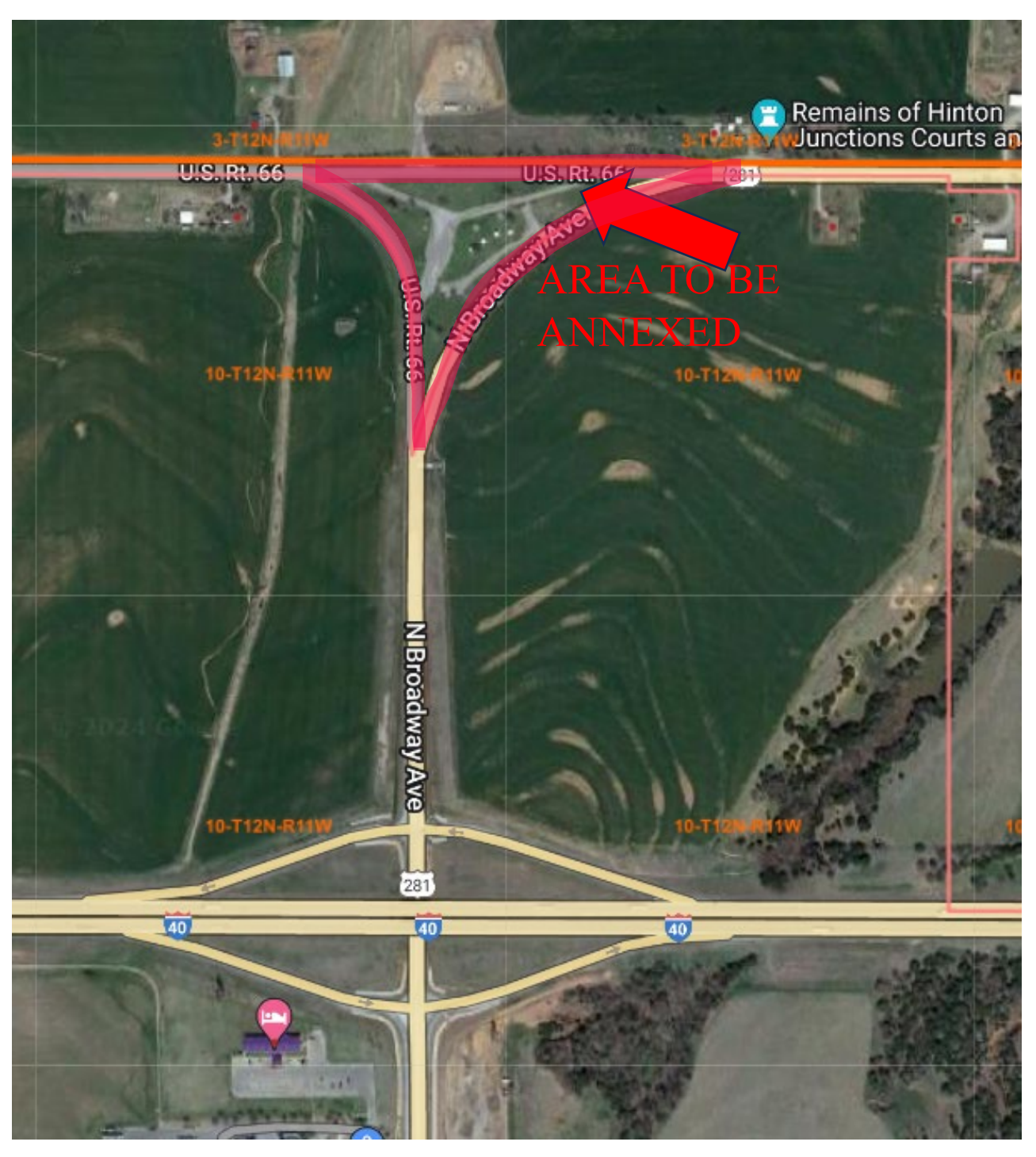
EXHIBIT A Page 2 of 3